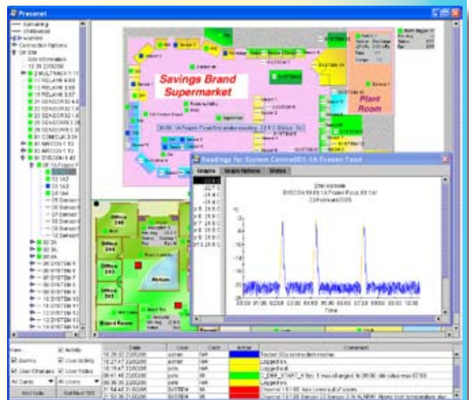
Pressnet Layout is clean and simple to use

Pressnet software is also available in a "lite" where a dedicated on site PC is not required for a lower installed cost. Both versions are intelligent enough to automatically configure themselves to the Presscon, so can be used straight away without complicated installation or configuration. If required, a customized site layout screen is simply setup.