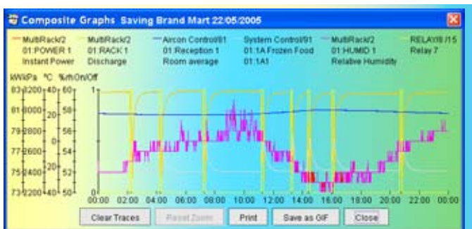
Composite graphs allow comparison of different parameters

* Pressnet lite contains most of the features of Pressnet, the main exceptions being memory limitations (8MB) and recording timebase ( 5 minutes compared to 1